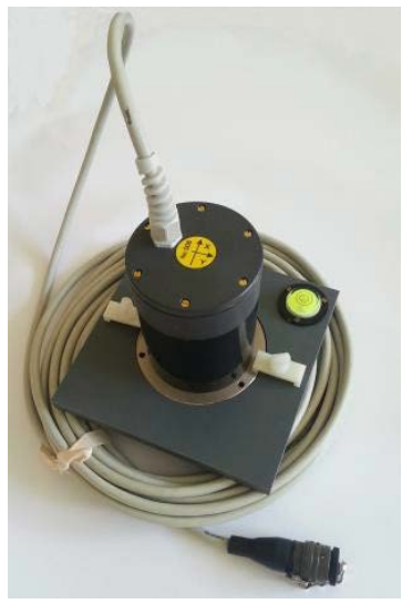
LEMI-424 3-Componet analogue Magnetometer