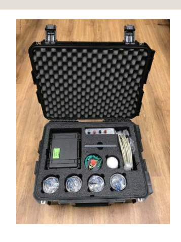
LEMI-424 system full set layout (left); LEMI-424 system in transportation case (right)

The Long-Period Magnetotelluric Station LEMI-424 is composed of two units - Data Logger (DL) and Analog Magnetometer (AM). DL (at the photo above) is developed for the analog signals received both from AM and from electric lines for telluric field measurements digitizing and storage. In order to realize the design of electric channels major attention was paid to thermal and temporal stability, high input impedance and low drift. High-pass filter-free technology of input stages was used in order to let super-long period signals (up to 100.000 second) to be measured. The lightning protection unit (at the photo, two models shown left and right, below) allows both the protection against nearby lightning discharges and easy connection of electric lines in the field. Specially developed very low noise LEMI-701 electrodes are recommended (at the photo, upper right), but any other electrode types may be used too (not included in the delivery set).